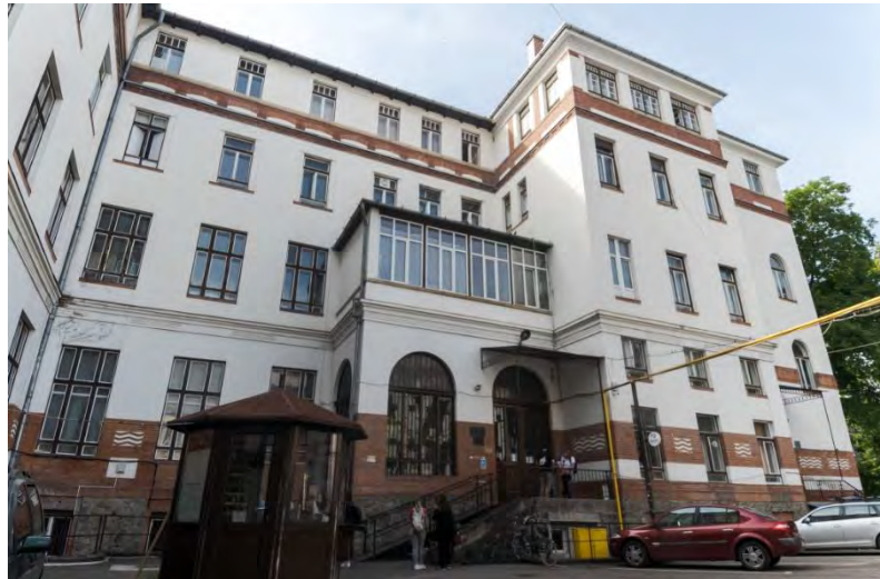
The campus of the Faculty of Biology and Geology

There are a lots of accommodation possibilities in and around Cluj. Hotels, hostels and pensions are everywhere, and they come in every shape and with very different prices. The middle of September should be ok, all the big festivals (Untold, Electric Castle, Jazz in the Park, Transylvania International Film Festival) are already over. For up to 15 participants we can offer accommodation in the Universitas Hotel of the UBB for 155 RON/night/person (circa 34 €). Breakfast is not included, it should be paid separately. Would you be interested, let us know in an e-mail. First come, first served.