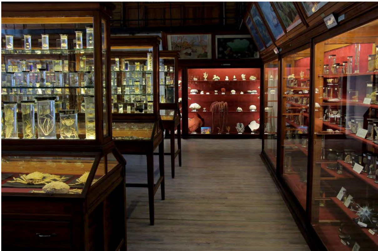
The Zoological Museum of the university in the campus of the Faculty of Biology and Geology.

If you wish to become member of the Central European Section of the International Union for the Study of Social Insects please consult the section's website .