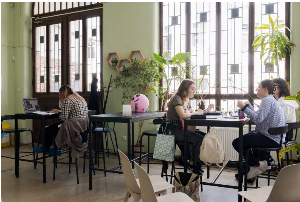
Science Café – the place where students can meet, work, relax between courses

We reject non-ethical behaviour, any type of discrimination, harassment, bullying. UBB adopted clear guidelines with regards to ethical behaviour , rejecting different forms of discrimination , promoting gender equality , and we are also signatories of the European research assessment reform, and members of CoARA . We promote gender equality, open science, constructive scientific debates and believe in collaboration as a motor of progress in science. The conference is intended to help early career researchers in networking, and generally to connect research groups for the benefit of scientific knowledge specifically concerning social insects.