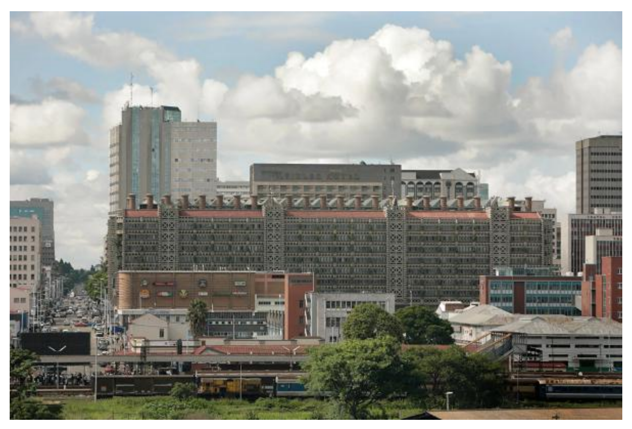
The air conditioning system of the Eastgate Centre in Harare, Zimbabwe, was inspired by termites' nests.